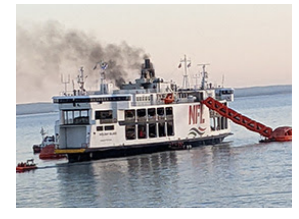
Unifor members saved lives with their quick action and brave management of a