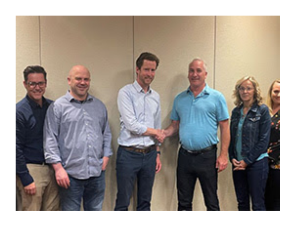
Nearly 800 newly organized WestJet workers in Calgary and Vancouver have